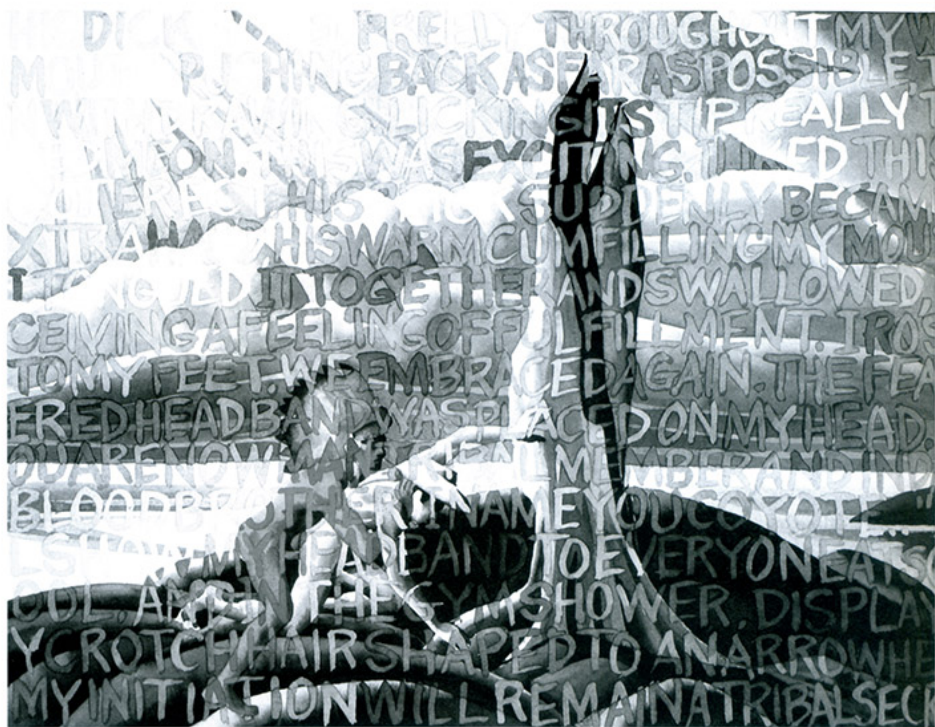
Kent Monkman, Superior , 2001.

The evolutionary historicism of George Catlin's nineteenth-century colonial gaze, designed to dominate and exterminate through simulated textual and image misrepresentations served up as factual documentation, along with Gerald Vizenor's theorization of present-day postindian storiers of survivance, offer a conceptual frame for approaching Monkman's transformative personal and artistic trajectory. Superior (2001) is perhaps the most eloquent articulation of Monkman's nascent postindian warrior. A direct quotation of Lawren Harris' iconic and endlessly reproduced North Shore, Lake Superior (1926), this work displays