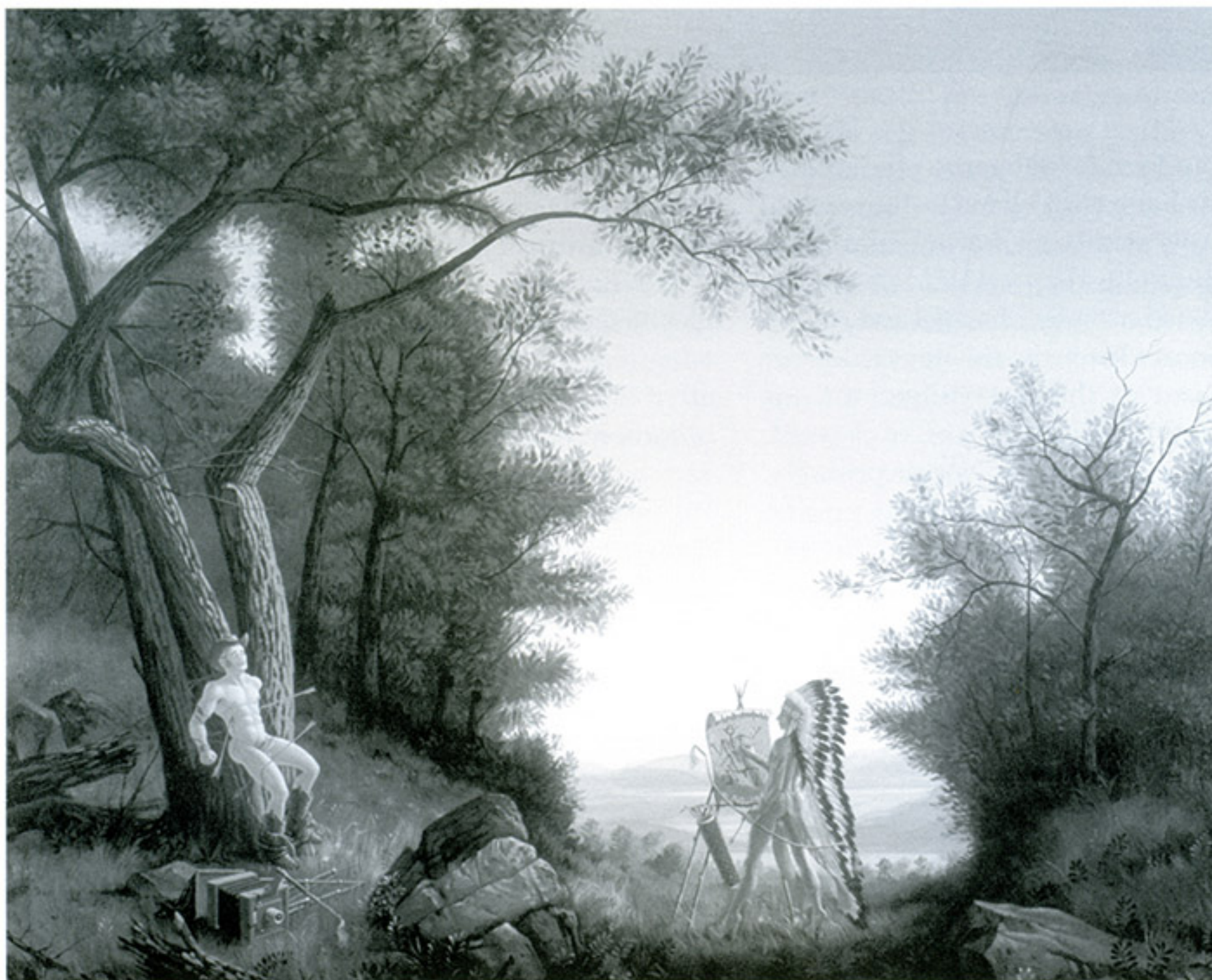
Kent Monkman, Artist and Model , 2003. Courtesy: the artist.

In addition to miming and inverting the fetish mechanics of the colonial gaze as metaphor for the hunt, this new "pictomyth" pulses explosively with the simulacral historical traces that transect and sustain it. Monkman's repetition of Paul Kane's romantic landscapes to the point of banality underscores Kane's continued domination of simulacral histories of the "tragic primitive" in Canada. Even the new First Peoples Gallery at the ROM has been organized around a central passage, painted a colorectal pink, that has been covered with Paul Kane paintings and pages from his diaries. 18 Included in the ROM display is Medicine Mask Dance (1848-1856), one of Kane's most reproduced paintings, which is an acknowledged work of fantasy and a mimetic quotation of Catlin's Dance to the Berdash , which is in turn the