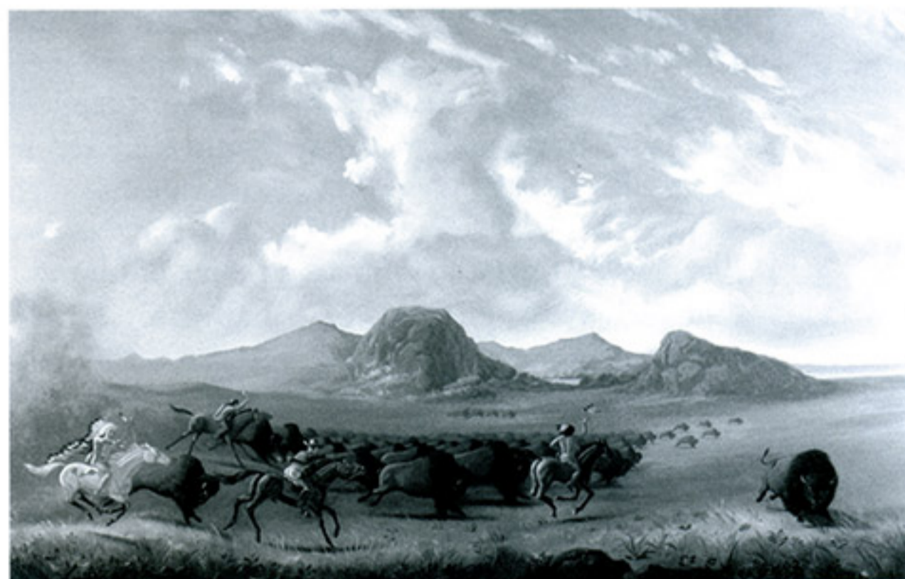
Kent Monkman, Portrait of the Artist as Hunter , 2002. Courtesy: the artist.

The painted letters of the porn text overlay are vaguely camouflaged as part of the landscape, but turn bright red over the warrior's body, then turn blue as they scroll over the cowboy's body. As the competing layers of the painting interact and coalesce into meaning, the work opens up into a realm beyond repetition. As