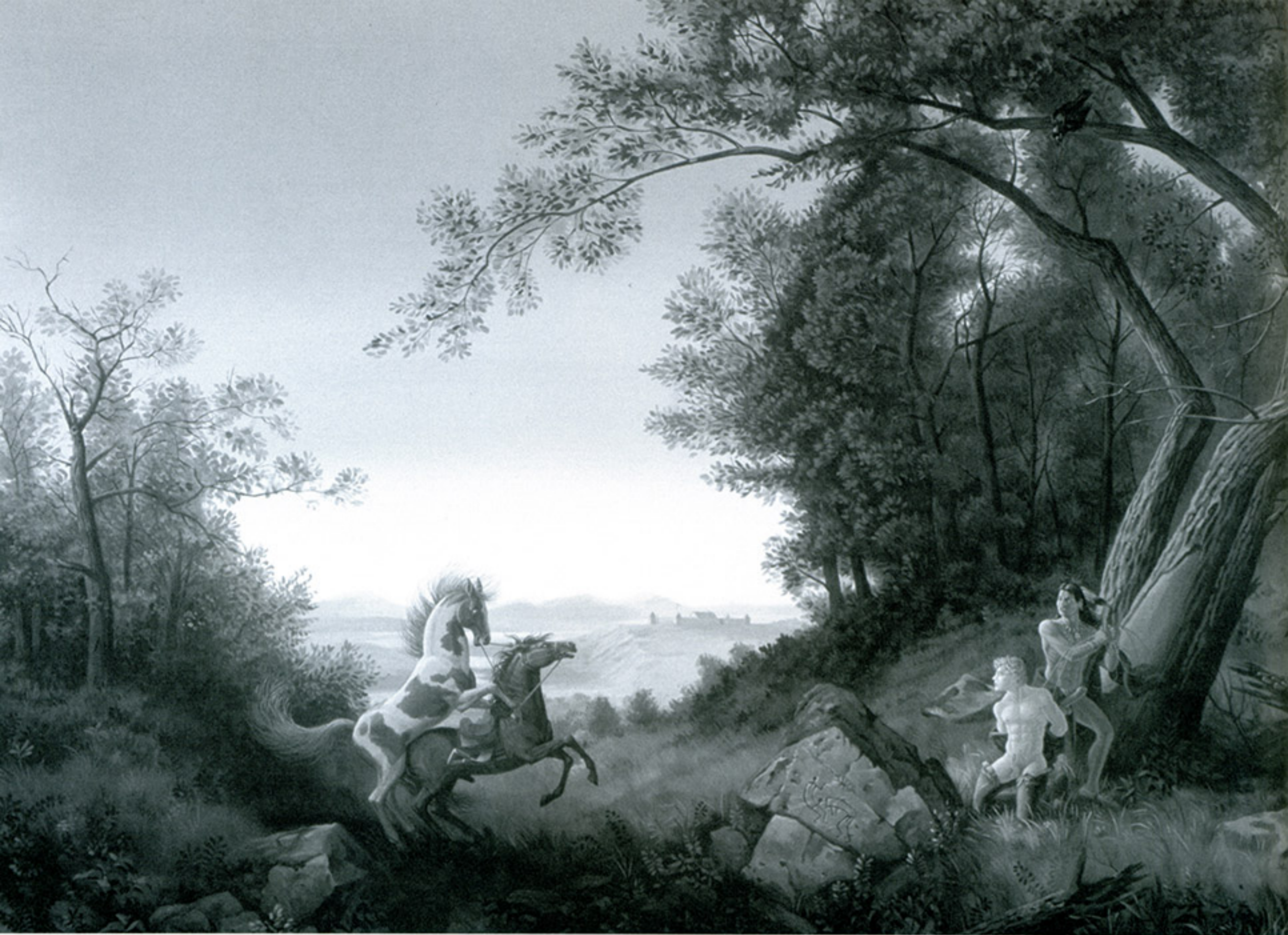
Kent Monkman, Fort Edmonton , 2003.

only image of sexual and gender difference produced by the colonial gaze that Kane then elided in his version. Kane's diaries are equally simulacral, having most likely been written by someone else. Artist and Model also reactivates a range of simulated histories of sexual and gender difference, perhaps most obviously, the martyrdom of the cowboy model cast as the martyrdom of Saint Sebastian, the most notoriously kitsch icon of closeted, sadomasochistic, homoerotic ecstasy. Not surprisingly, the widely accepted representation of the lithe Christian convert Sebastian's death by arrows for refusing the advances of the lecherous pagan Emperor Diocletian is a simulation. Surviving the arrows and continuing to proselytize, Sebastian actually came to a much less elegant end; he was clubbed to death and his body dumped