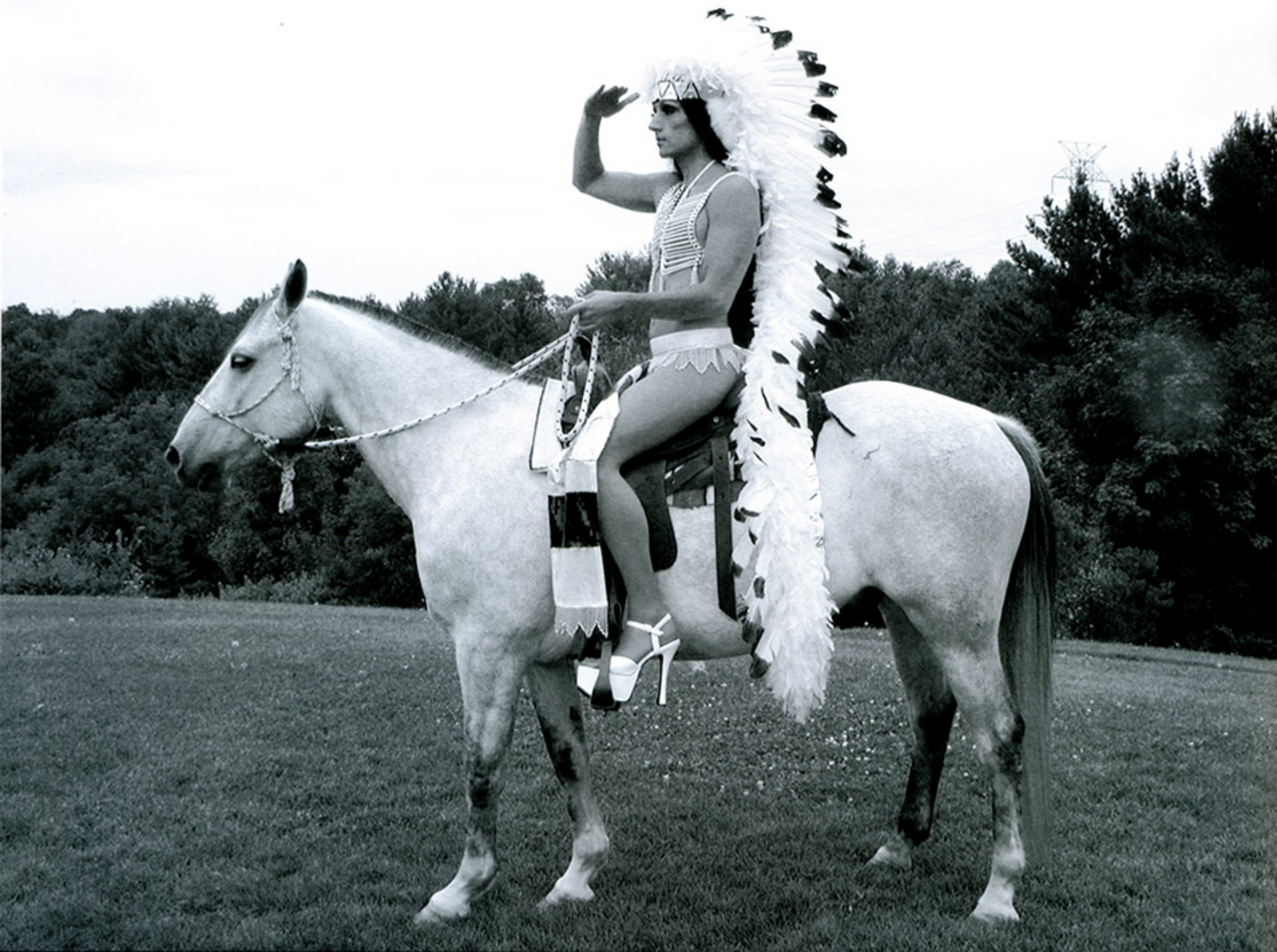
Kent Monkman, Still from Group of Seven Inches , 2005.